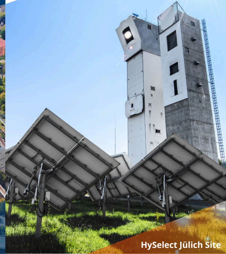
HySelect Jülich Site