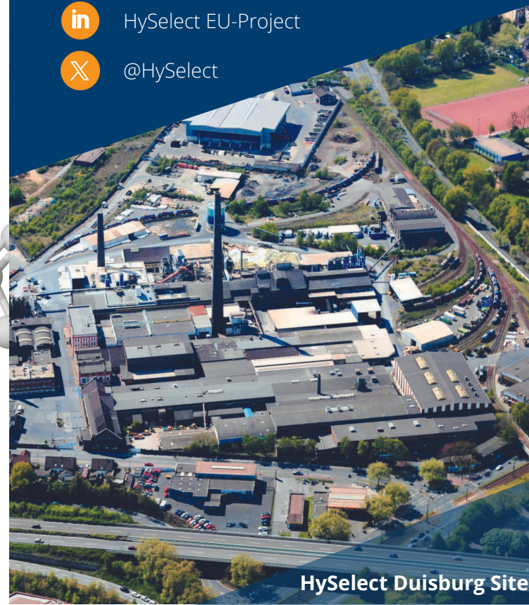
HySelect Duisburg Site